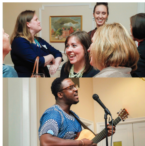
BOTTOM PHOTOS: JUSTICE REVIVAL’S INAUGURAL DC BENEFIT WAS AN EXCITING MILESTONE AND DREW A DIVERSE GROUP OF HUMAN RIGHTS-ALLIED PARTICIPANTS.